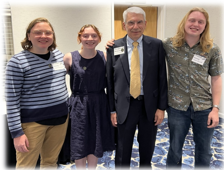
14th generation descendants of Robert Linnell

Following the banquet, the evening culminated with many cousins adjourning to the hotel’s fire pit area for spirits and continued revelry!