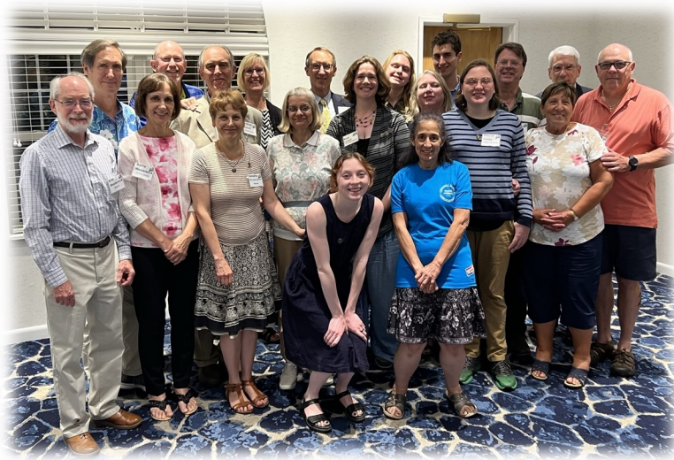
2022 Linnell Family Reunion Attendees

The discussion on future reunions is of special interest. For those keeping track, there were four years between this year's reunion and the last in 2018. There is a feeling that every four years is best vs a three-year reunion interval given the decline in participation since the 2012 reunion in Grand Portage, MN. Intertwined with that discussion was the realization that 2038 marks the 400 th