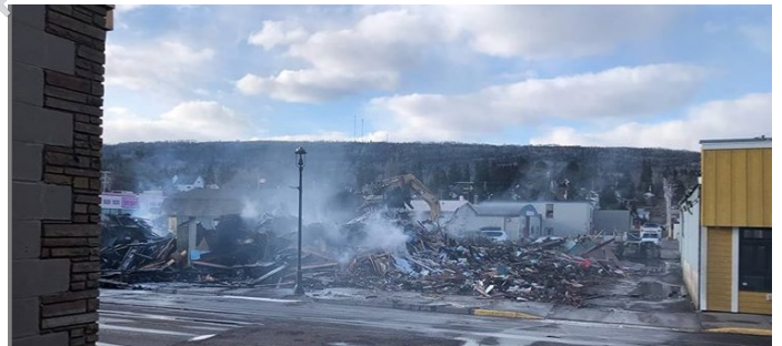
A fire on April 13 destroyed three downtown businesses next to Sven and Ollie's.

PS I think the steering committee will totally agree with me that we need to send our best wishes to all those people up in good ol' Grand Marais in dealing with the tragic fire. It will probably be quite some time before everything is 'back to normal' in that great 'city.'